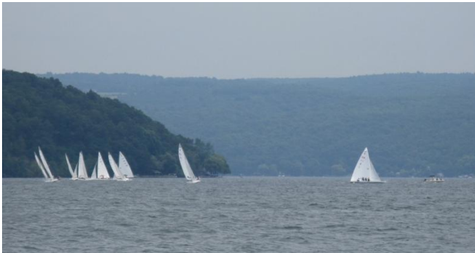
E-Scows off the bluff (File Photo).

On September 6th, the Annual Meeting was held at the KYC. There was a quorum, after several people were forced to abandon their lawn chairs outside. I have not received any official results, but my friends tell me that the proposal to reinstate the “social membership” category was approved. The proposal to eliminate free membership for some board members was also passed.