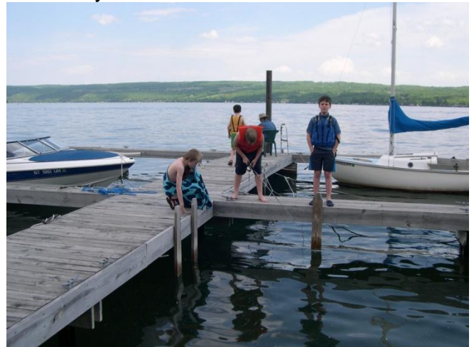
A fish has been caught !!!!!!!!!!!!! (not really )

On Sunday it was really WINDY !!!!!!!!!!!!! I went out sailing with my dad on our laser and it was lots of fun. We went so fast and heeled so much we almost flipped over. I hope it's that windy next weekend.