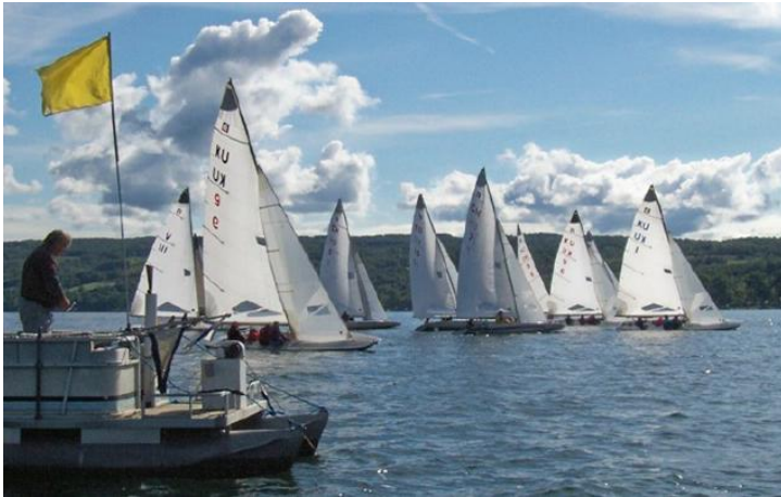
The start of Day 2 of the FLACE regatta.