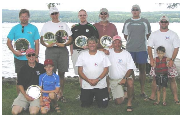
MC Sailors after the Nor'Eastern Championship